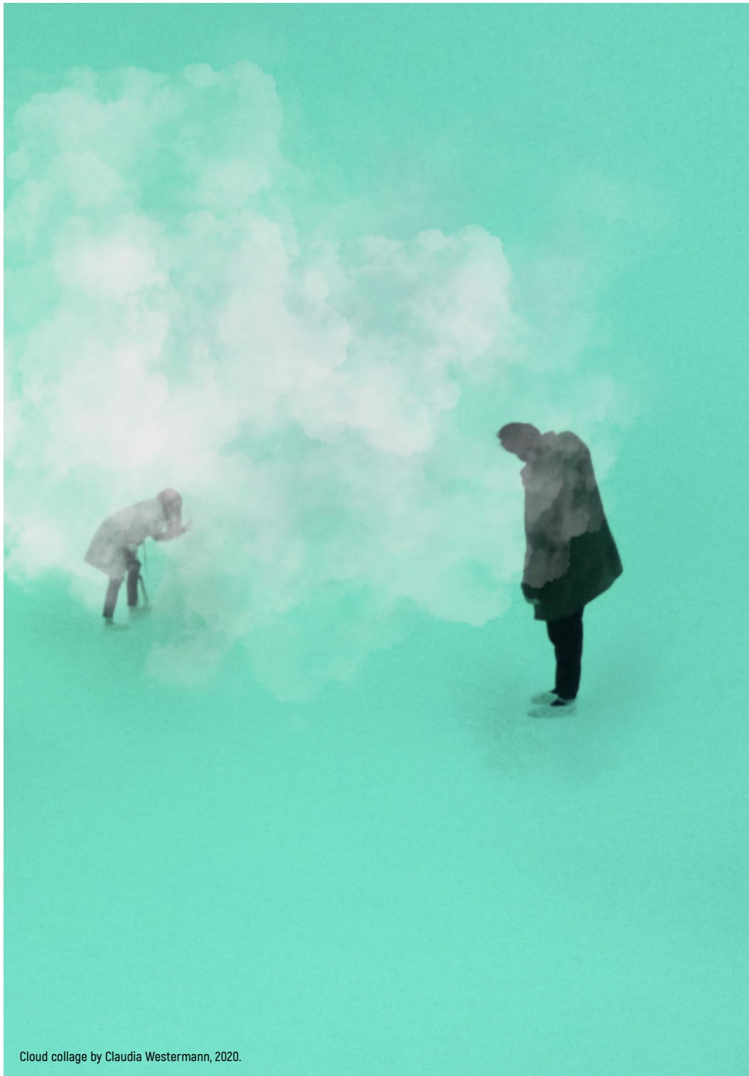
Cloud collage by Claudia Westermann, 2020.